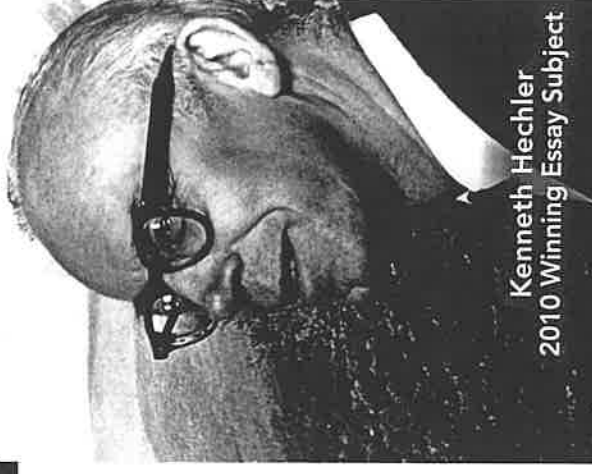
Kenneth Hechler 2010 Winning Essay Subject