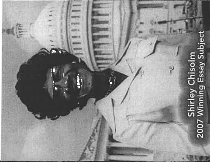
Shirley Chisolm 2007 Winning Essay Subject