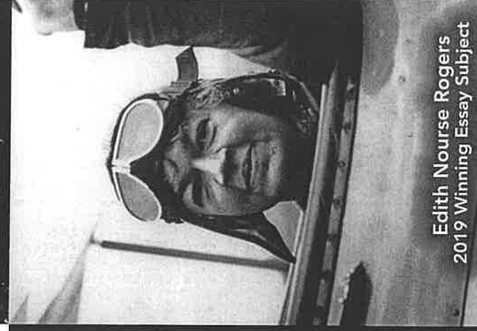
Edith Nourse Rogers 2019 Winning Essay Subject